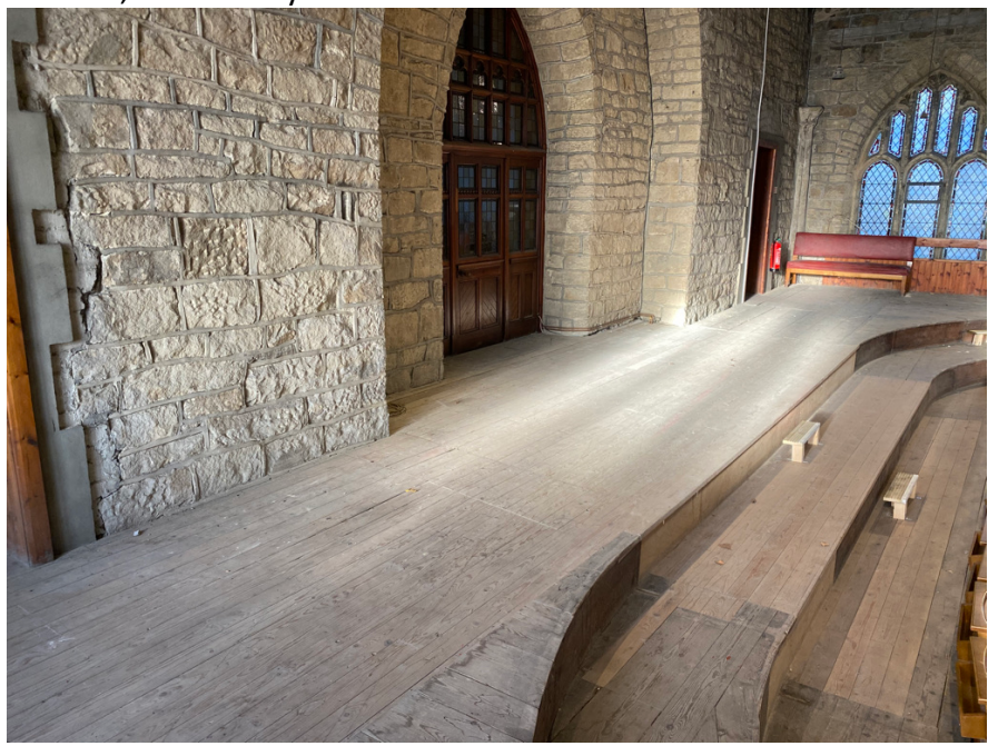
Photo 3, The Gallery area at the west end of the church where the chairs will be placed

Photo 4 view of area where the chairs will be located